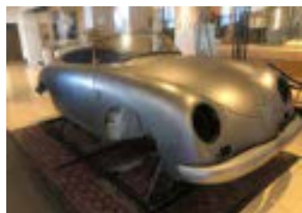
Cover Photo: Restoration Design's LA Lit Meet Static Display

See 356CAR.org/Calendar for Coming Events