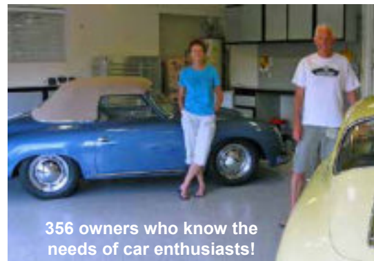
356 owners who know the needs of car enthusiasts!