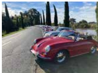
Cover Photo: ... at 2021 GoF - Grand Isle Mansion.

See 356CAR.org/Calendar for Coming Events